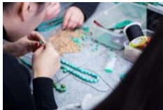
December 2, 9, and 16 – Alternative Gift Market

2-4 pm – Pentecostal Church rents sanctuary Tuesday 7pm – Board Rm rented